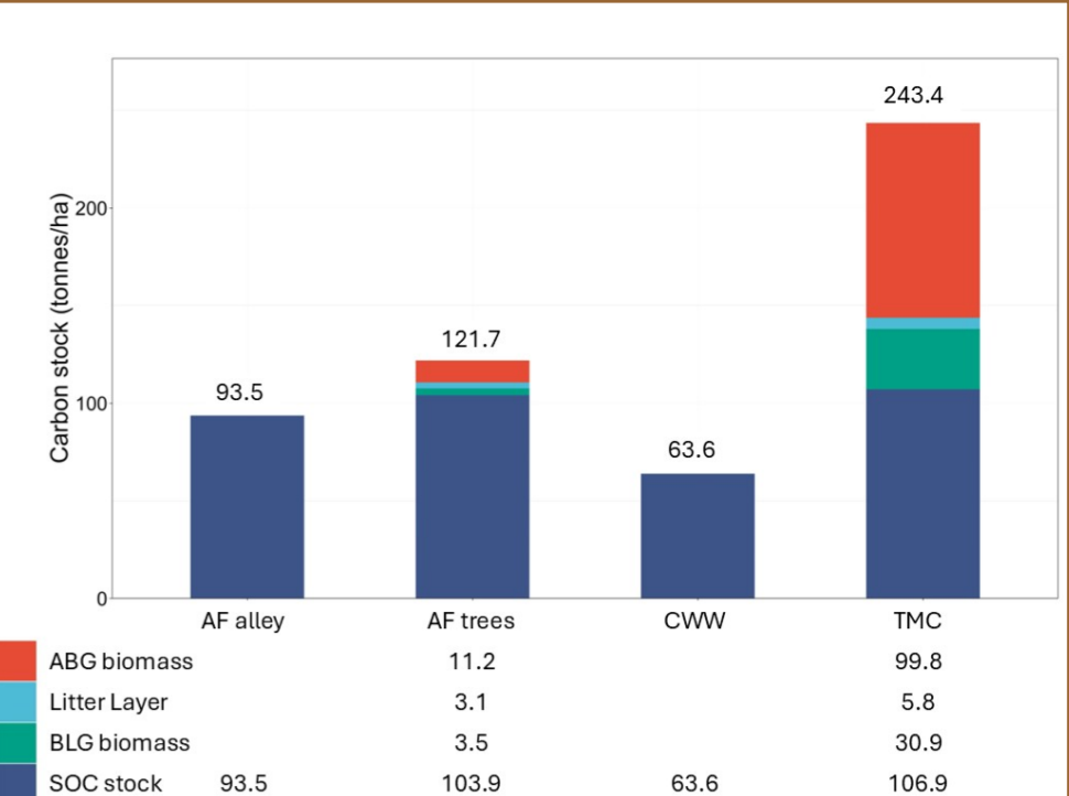
Fig. 2. Carbon stocks in different components of agroforestry (AF trees and AF alley), conventional winter wheat (CWW) and tree monoculture (TMC). ABG biomass: aboveground biomass; BLG biomass: belowground biomass; SOC stock: soil organic carbon

Allometric equations (Ghaley and Porter (2014) were used to estimate the ABG of the short rotation woody crops (SRWC). The belowground tree biomass (root system) was estimated using a Root-To-Shoot (RTS) ratio of 0.31, as recommended by the IPCC (2003) guidelines for temperate broadleaf species. The conversion of above- and below-ground dry biomass to C content was done as per IPCC (2006a) for temperate broadleaf species with 48% of the tree biomass considered as C. The litter layer was sampled and oven dried at 80<sup>o</sup> C and the C content was estimated based on its dry weight. C fraction of 0.37 is considered as per the IPCC (2006b) guidelines for litter and dead organic matter. The ABG biomass and C stock in the TMC was estimated with the Woodland Carbon Calculator (WCC 2024). SOC content was measured on fresh soil samples taken from 0-30 cm and SOC was analyzed using Agrocares Soil scanner.