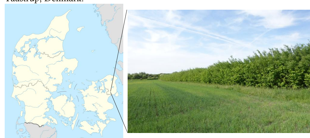
Figure 1. The CFE agroforestry system (right) is located in Taastrup, Denmark (left).

The study objective was to investigate SOC contents and evaluate its benefits on crop yields in a 30-year-old organic agroforestry alley-cropping system in Taastrup, Denmark.